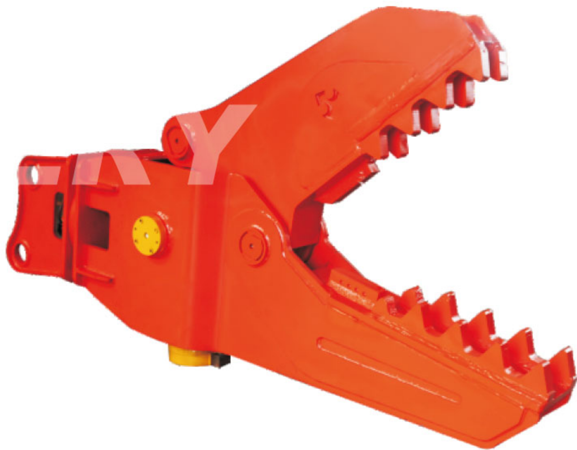
Hydraulic rotation shear